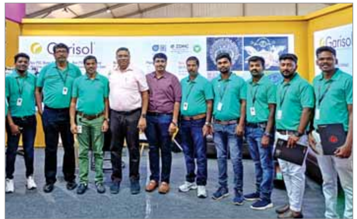
Texlite Chem (Garisol) Team