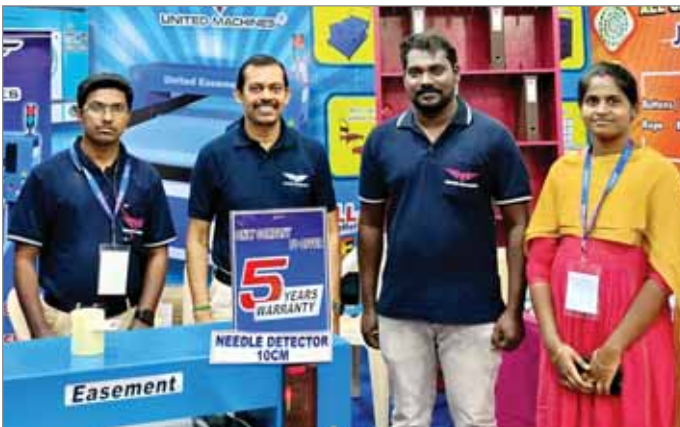
United Machines Team