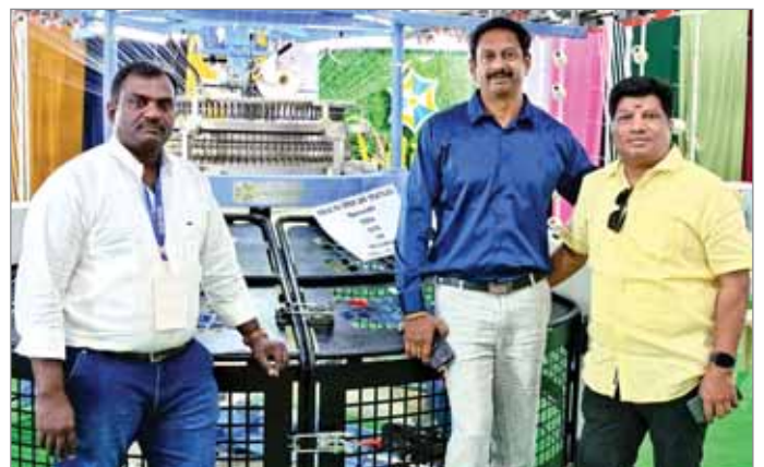
Knit Tex Team