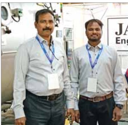
Jayaa Engineering Team