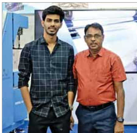
RVR Machinery Team