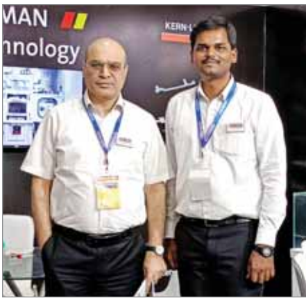
Kern - Liebers Team