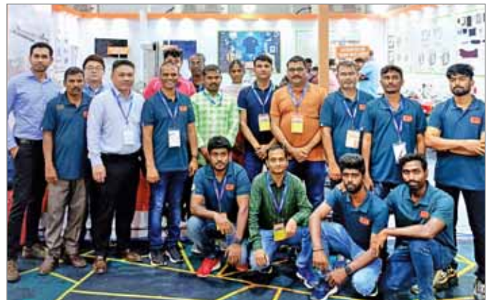
New Future Tech & Ningbo Supreme India Team