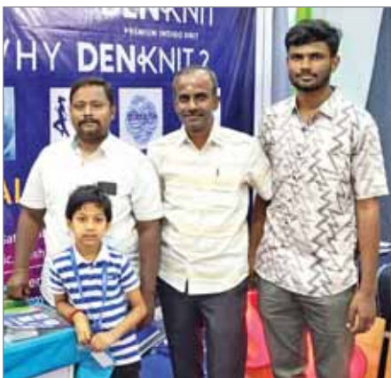
Sri Palani Andavar Silks Team