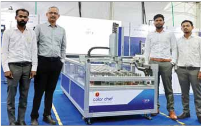
SPI Equipments Team