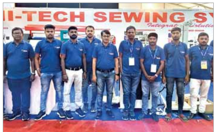
Hi-Tech Sewing Systems Team