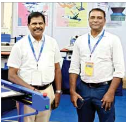
Chola Machine LLP Team