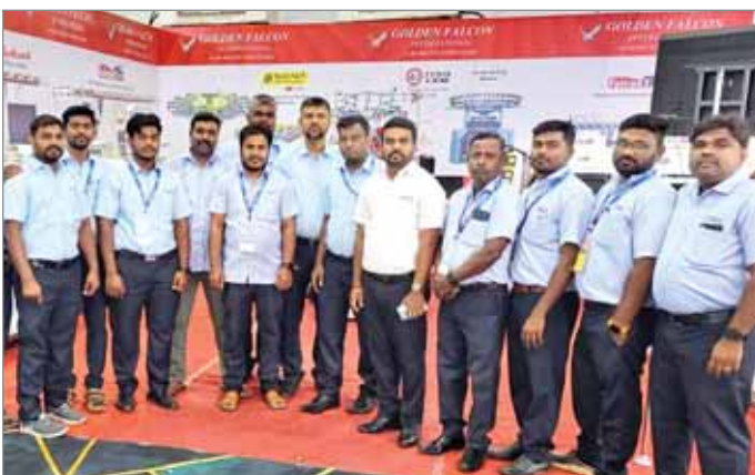
Golden Falcon International Team