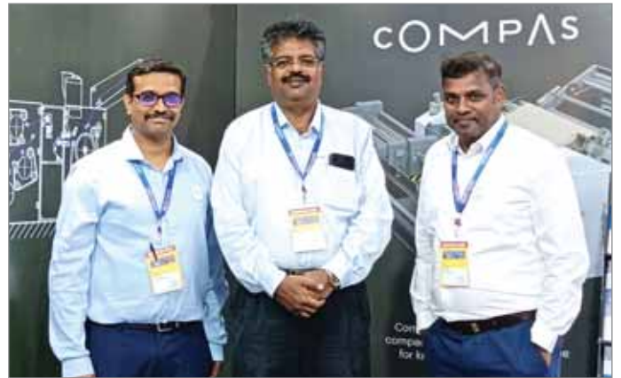
Santex Rimar India Team