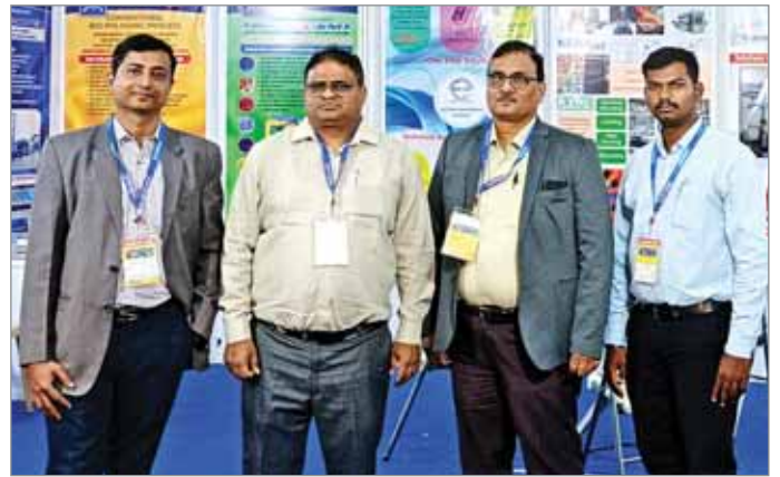
Fourwents Engineering Team