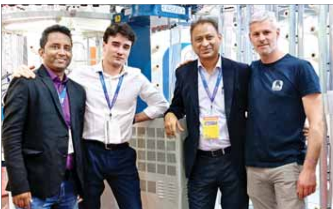
ORIZIO Srl Team