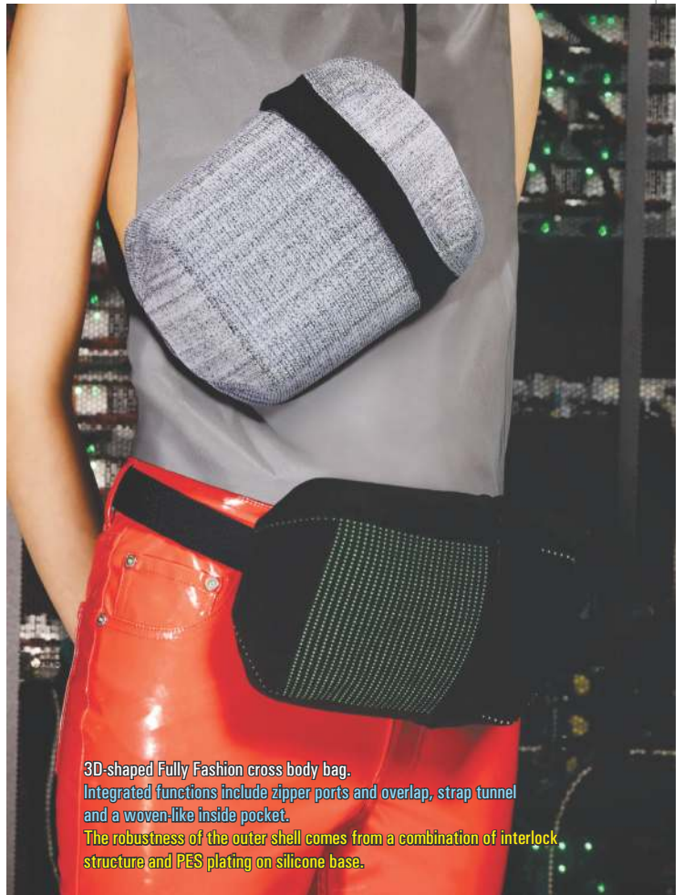
3D-shaped Fully Fashion cross body bag. Integrated functions include zipper ports and overlap, strap tunnel and a woven-like inside pocket. The robustness of the outer shell comes from a combination of interlock structure and PES plating on silicone base.