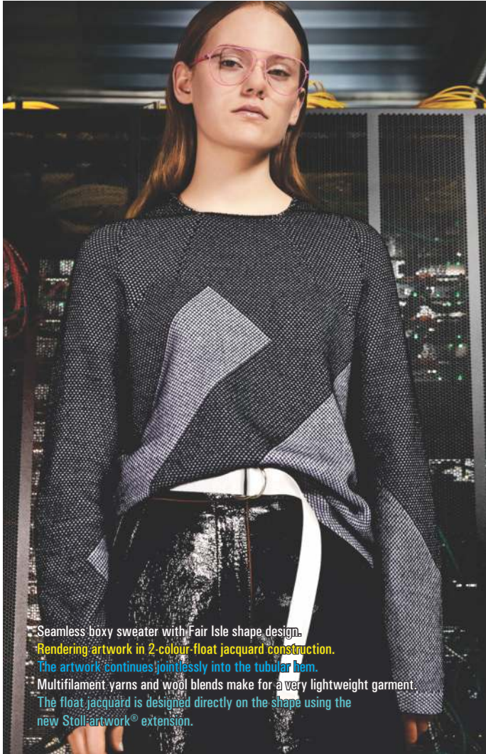
Seamless boxy sweater with Fair Isle shape design. Rendering artwork in 2-colour-float jacquard construction. The artwork continues jointlessly into the tubular hem. Multifilament yarns and wool blends make for a very lightweight garment. The float jacquard is designed directly on the shape using the new Stoll-artwork® extension.