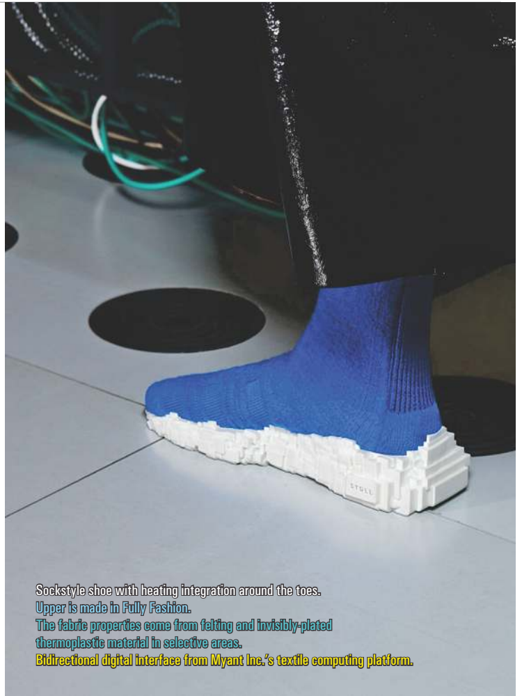
Sockstyle shoe with heating integration around the toes. Upper is made in Fully Fashion. The fabric properties come from felting and invisibly-plated thermoplastic material in selective areas. Bidirectional digital interface from Myant Inc.'s textile computing platform.