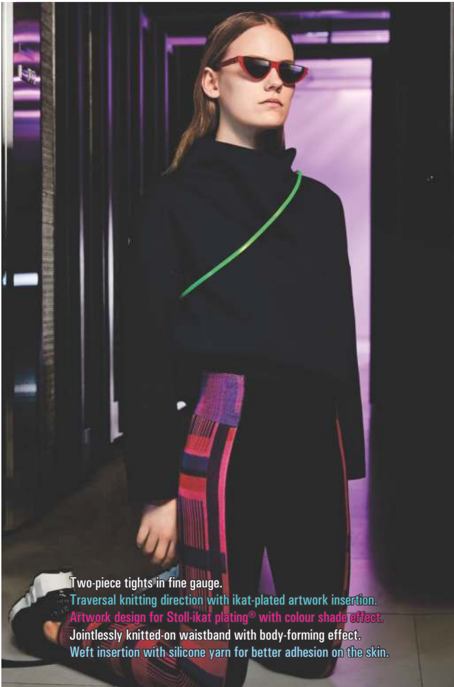
Two-piece tights in fine gauge. Traversal knitting direction with ikat-plated artwork insertion. Artwork design for Stoll-ikat plating® with colour shade effect. Jointlessly knitted-on waistband with body-forming effect. Weft insertion with silicone yarn for better adhesion on the skin.