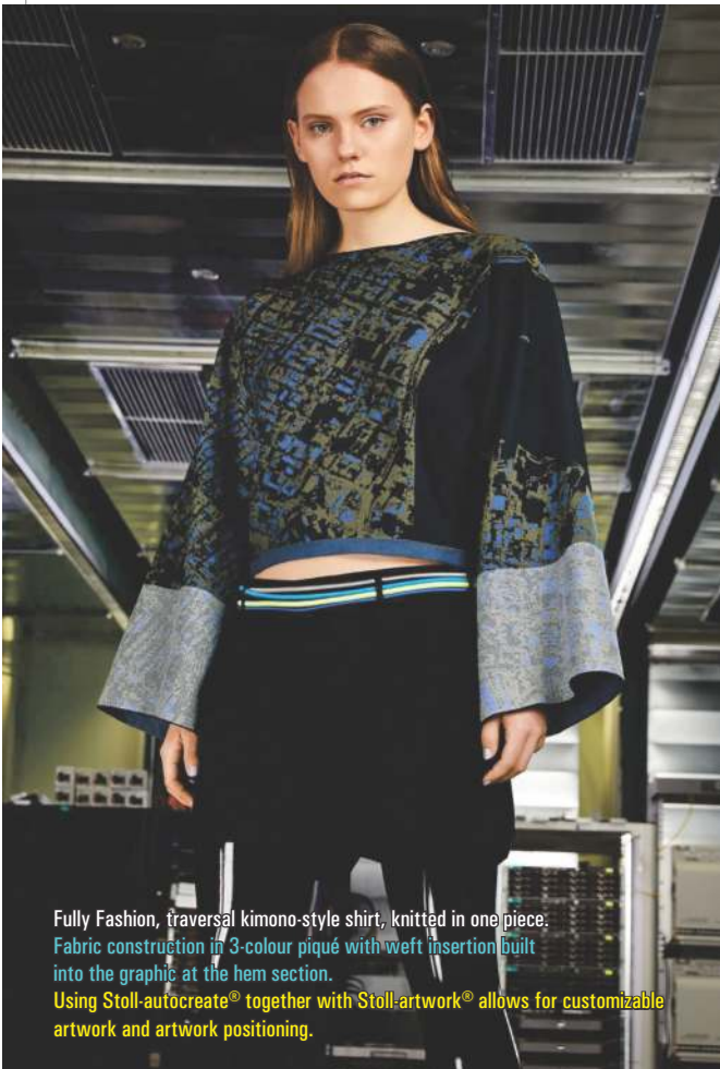
Fully Fashion, traversal kimono-style shirt, knitted in one piece. Fabric construction in 3-colour piqué with weft insertion built into the graphic at the hem section. Using Stoll-autocreate® together with Stoll-artwork® allows for customizable artwork and artwork positioning.