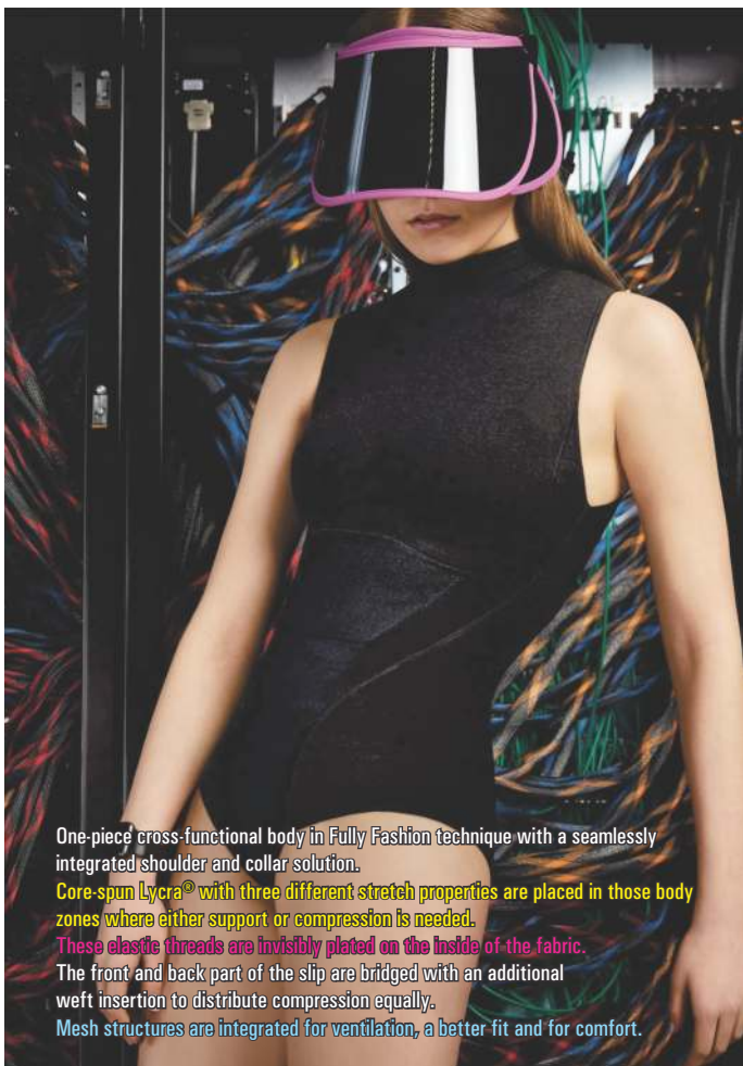
One-piece cross-functional body in Fully Fashion technique with a seamlessly integrated shoulder and collar solution. Core-spun Lycra® with three different stretch properties are placed in those body zones where either support or compression is needed. These elastic threads are invisibly plated on the inside of the fabric. The front and back part of the slip are bridged with an additional weft insertion to distribute compression equally. Mesh structures are integrated for ventilation, a better fit and for comfort.